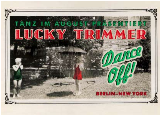
Tanz im August, 2007